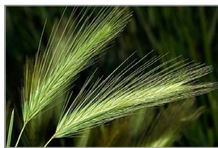
Grass, Farmer's Foxtail— Hordeum murinum HOR