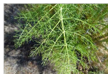
Sweet Fennel— Foeniculum vulgare FOE