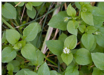
Chickweed— Stellaria media STE