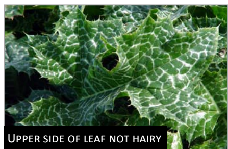
Thistle, Milk— Silybum marianum SIL