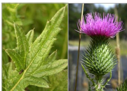
Thistle, Bull— Cirsium vulgare CIR