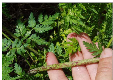
Poison Hemlock— Conium maculatum CON