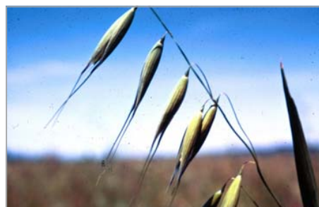
Grass, Wild Oats— Avena fatua AVE