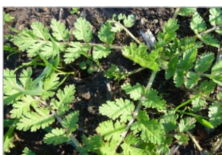
Storksbill— Erodium maculatum ERO