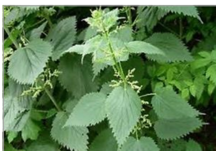
Dwarf Nettle— Urtica urens URT