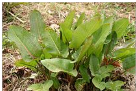
Dock (nonnative)— Rumex spp. RUM