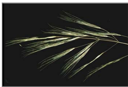
Grass, Rippgut Brome— Bromus diandrus BRO-D