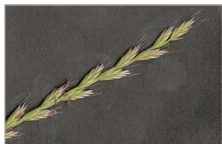
Grass, Italian Rye— Lolium multiflorum LOL