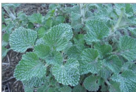
Horehound— Marrubium vulgare MRB