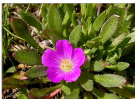
Red Maids— Calandrinia ciliata CAL