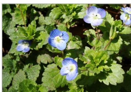
Persian Speedwell— Veronica persica VER