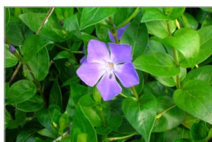
Vinca— Vinca major VIN