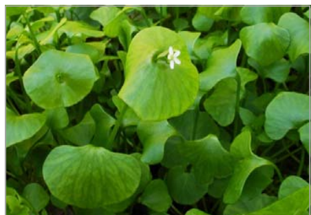
Miner's lettuce— Claytonia perfoliata CLA