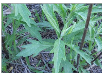
Mugwort— Artemisia douglasiana ART