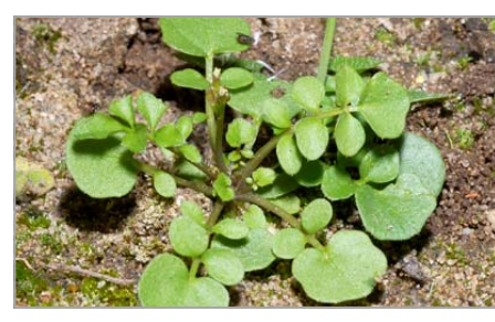
Western Bittercress— Cardamine oligosperma CRD