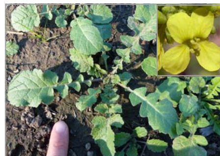
Short Pod Mustard— Hirschfeldia incana HIR