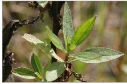
Marsh Baccharis— Baccharis douglasii BAC-D