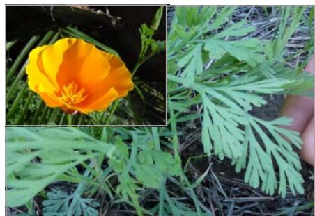
California Poppy— Eschscholzia californica ESC