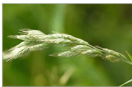
Grass, Soft Chess— Bromus hordeaceus BRO-H