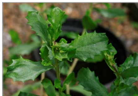
Coyote Bush— Baccharis pilularis BAC-P