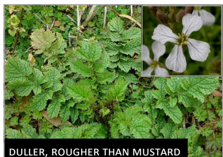
Wild radish— Raphanus raphanistrum RPH