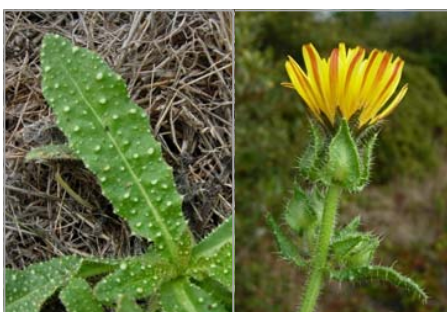
Thistle, Bristly Oxtongue— Picris echioides PIC