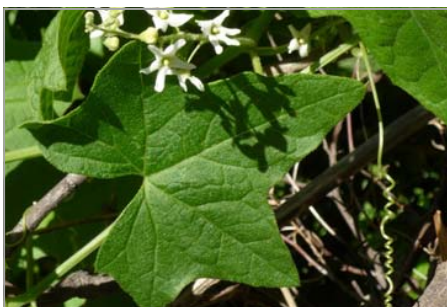
Wild Cucumber— Marah fabaceus MRH