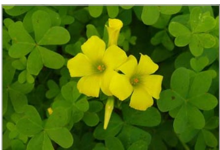
Sour Grass— Oxalis pes-caprae OXA