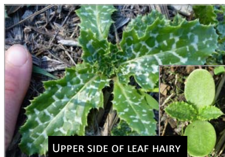
Thistle, Italian— Carduus pycnocephalus CAR