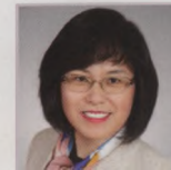
Hon. Yan Zhao Former Mayor & Current City Councilmember City of Saratoga APALI Civic Leadership Program 2014

“No one can tell your story better than you. Your lived experience is valuable. Don’t let anyone tell you otherwise. Your story and your experiences are the soul of your leadership. Embrace them and let your truths lead.”