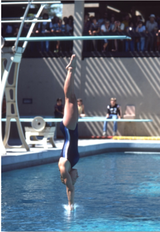
Diving contests were held at the pool. Notice this diver's form - entering the water perfectly straight, with both feet pointed up. A perfect 10!

After entertaining the public at De Anza Days for three decades, why did it not continue? Most of the campus staff that worked at the event were volunteers – those volunteers became much harder to come by as the years went on. And then there were the costs and the damages to the campus. In the 1970s over $4,000 was spent each year on extra security, extra custodial services and extra electricity needed to power all of the shows. While $4,000 seems low, even by 1970s standards, the cost was offset by funds collected from sponsors, artisans and food concessionaires who were selling their wares. The campus was built to handle up to 14,000 people at one time, but over 60,000 people showed up when the event was at its peak. Delivery trucks damaged lawns, shrubs and sprinkler heads and many vending machines were damaged due to vandalism. All of this was costly and was a distraction from the campus' primary mission – education. So, sadly, we will not likely see De Anza Days again, but it sure looked like fun while it lasted!