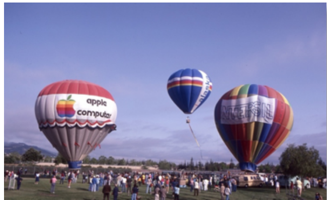
Contributions from companies such as Apple, Intersil and Alaska Airlines helped to reduce the cost of the event.

In 1976, lectures were offered all over campus and included topics such as Future Technologies, Alternative Living and Art and Entertainment. The Auto Tech group showcased electric cars, obviously slightly ahead of the trend. Edmund G, Brown, Jr., former Governor of California, even showed up to address the crowd at the track area.