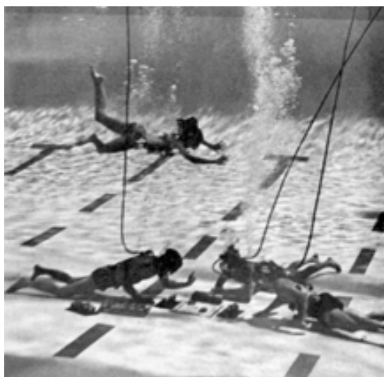
An underwater game of monopoly is played by students at the bottom of the De Anza pool.

In 1972, only the second year of the event, forty thousand people came to see water polo, fashion shows and Olympic diving competition at the pool. The fine arts were represented with weaving and needlepoint exhibitions, along with “glu-ins” for the