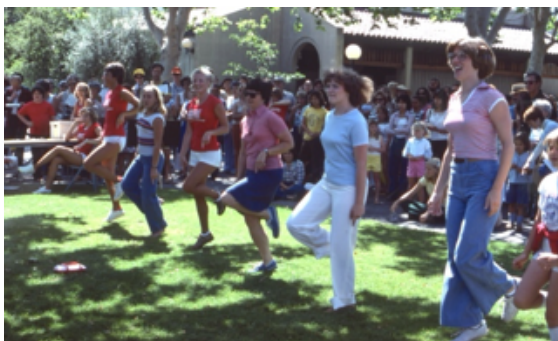
Young women competed in a contest to stand longest on one leg. The winner lasted over five hours!