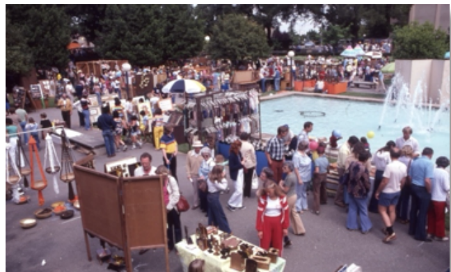
Vendors were set up in the Sunken Garden, offering all sorts of hand-made items.