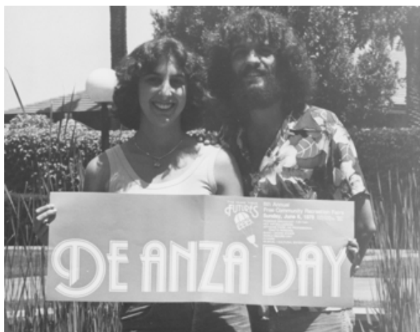
Two students hold up a promotional sign for De Anza Day in 1978.

De Anza Days began in 1971, only four short years after the college opened its doors to students, and would continue to be held on the first Sunday in June until the mid 1990s. It was called a “community recreation fair.” The only cost to attendees was food and crafts – almost everything else was free. The only exception was a ride in a hot air balloon, which cost $5.