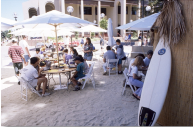
In the 90s, a beach was imported for use in front of the library.

The jumpers formed two-and-three-man star clusters and, jumping from over 5,000 feet, would then open their chutes with explosions of bright color while the audience cheered. The San Francisco Aquanuts performed their zany show at the pool, including acrobatic stunts while jumping, falling and diving off the diving boards. Gymnastic exhibitions were held in the nearby gym.