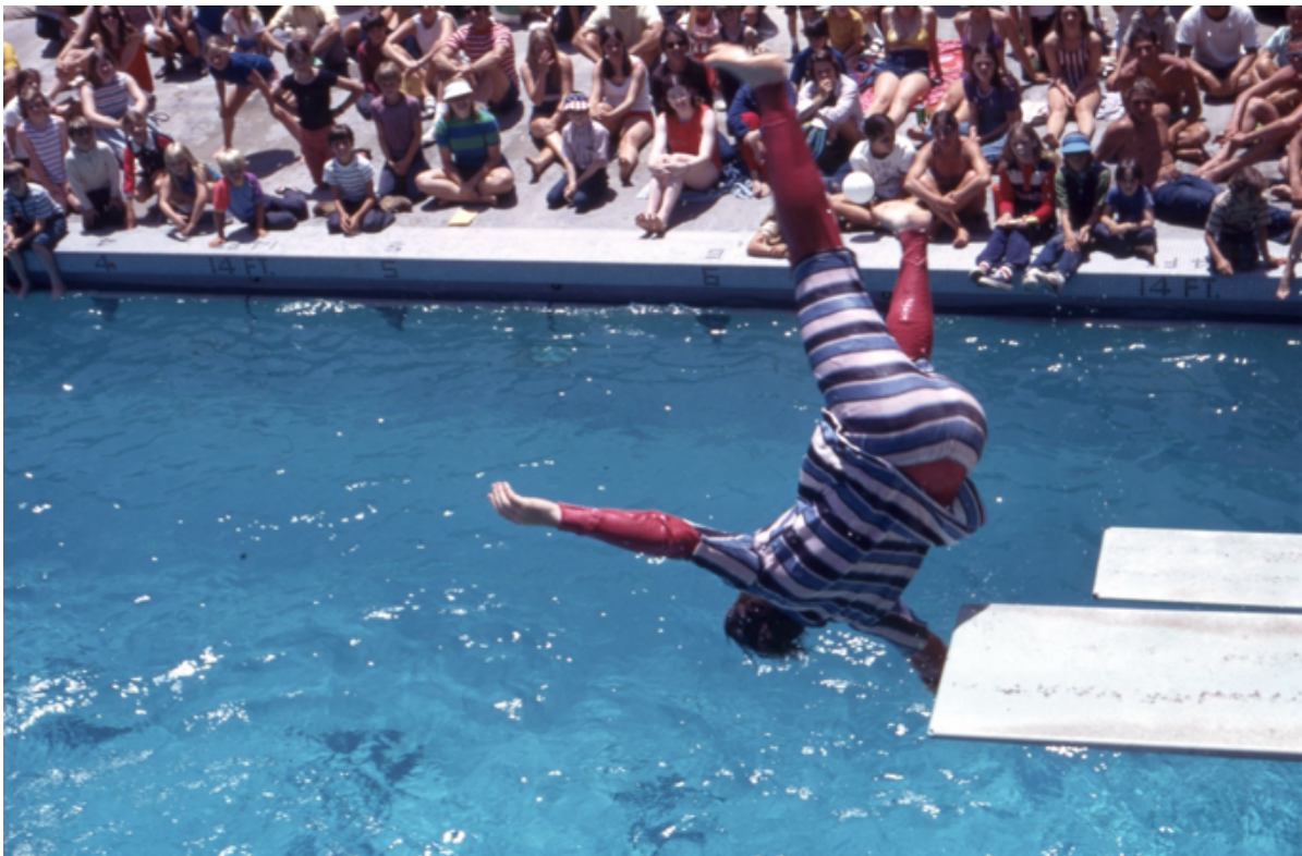
Not all the diving was picture perfect. Clowns performed some crazy, acrobatic dives that were just as difficult as the perfect ones.

After entertaining the public at De Anza Days for three decades, why did it not continue? Most of the campus staff that worked at the event were volunteers – those volunteers became much harder to come by as the years went on. And then there were the costs and the damages to the campus. In the 1970s over $4,000 was spent each year on extra security, extra custodial services and extra electricity needed to power all of the shows. While $4,000 seems low, even by 1970s standards, the cost was offset by funds collected from sponsors, artisans and food concessionaires who were selling their wares. The campus was built to handle up to 14,000 people at one time, but over 60,000 people showed up when the event was at its peak. Delivery trucks damaged lawns, shrubs and sprinkler heads and many vending machines were damaged due to vandalism. All of this was costly and was a distraction from the campus' primary mission – education. So, sadly, we will not likely see De Anza Days again, but it sure looked like fun while it lasted!